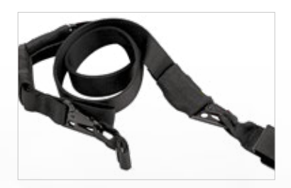
3 POINTS SHOTGUN STRAP