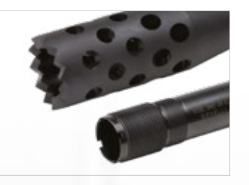
DOOR-BREACHER AND ADAPTOR