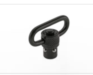
QD SLING SWIVEL