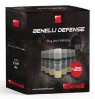
2 Slug Armor-Piercing